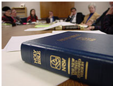
Parishioners gather in one of St. George's meeting rooms for Christian Education after regular services.

In these ways we celebrate relationships with Christ and His Church. Increasing numbers are a sign that God in his Word, Jesus, is touching people's lives: "And the word of God was increasing in power; and the number of the disciples ...became very great..." (Acts 6:7). We are members of the Body of Christ in order to extend the power of his Presence, but not as when we become members of a growing club, but as we become the hands, feet and voice of Christ. There is great blessing in being an agent of God, whether in a large church or a small one.