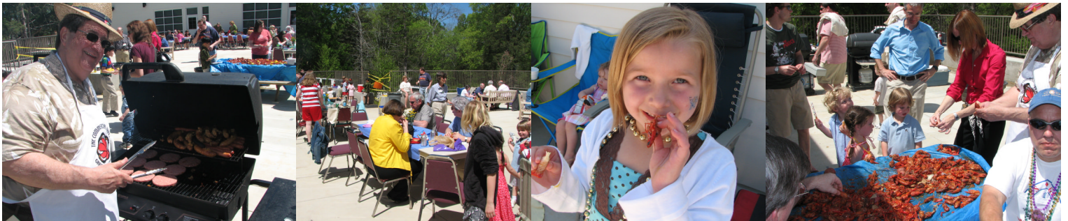
This Year's Annual Parish Picnic and Crawfish Boil was hosted by the Brotherhood of St. Andrew. If you are new to St. George's, do not miss a great opportunity to meet new people. If you are not so new, just come out anyways. Good friends, food and fun; what more could you want?